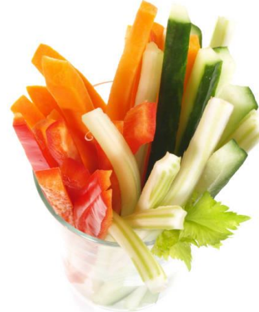
Chopped fresh vegetables