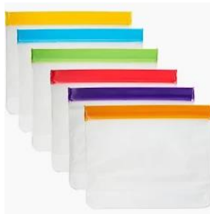
Reusable food bags