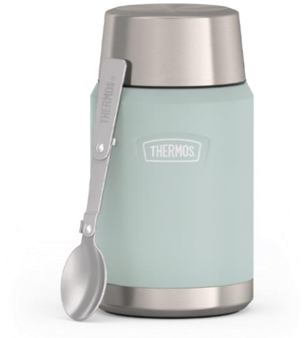
Thermos for hot food, like soup