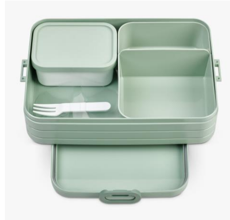
A lunchbox with multiple compartments