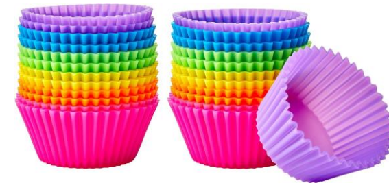
Reusable baking cases