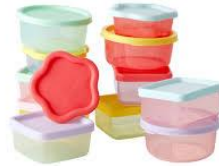
Small individual snack pots