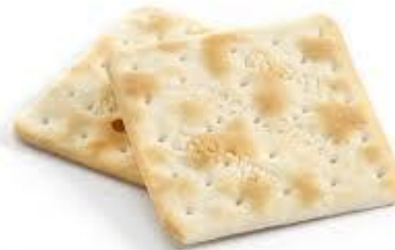
Crackers from a large pack