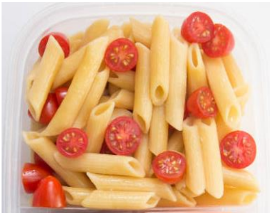
Leftovers, such as pasta